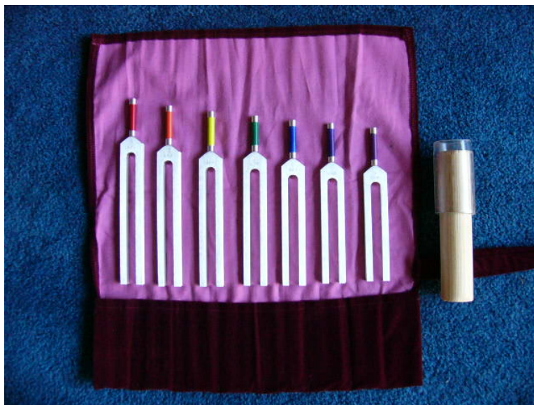
Seven Fork Chakra set with Pouch and Striker

Each fork is held over the corresponding chakra location, about 1 foot in front of the body. The receiver can be standing, sitting, or lying. I use a special striker to hit the fork on, to avoid detuning the fork, which can happen if the striking service is hard and inflexible. A striker comes with the complete set.